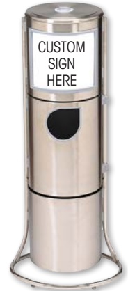
P014800 (Signs Ordered Separately from Stand)