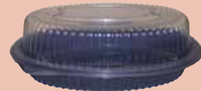
M1180D + LH1180D