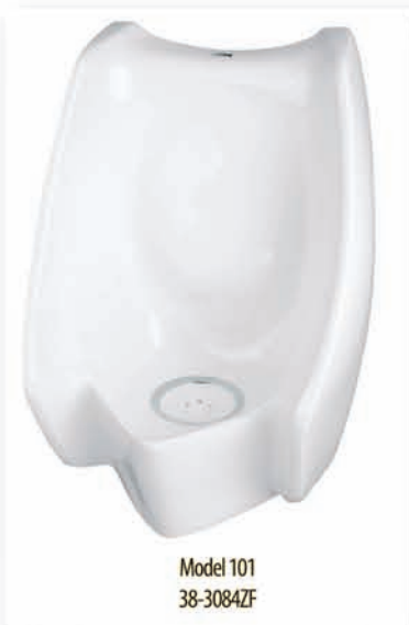
Model 101 38-3084ZF

OUR SLEEK MODERN DESIGNS HELP REDUCE SPLASH AND KEEP FLOORS DRIER.