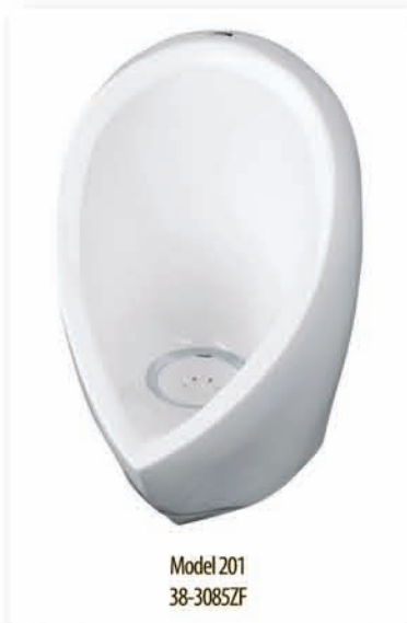
Model 201 38-3085ZF