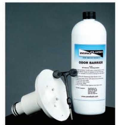
Odor Barrier Replacement Kit 38-3087KIT

* Chemical free and 100% environmentally friendly