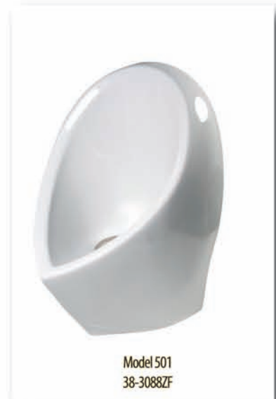
Model 501 38-3088ZF