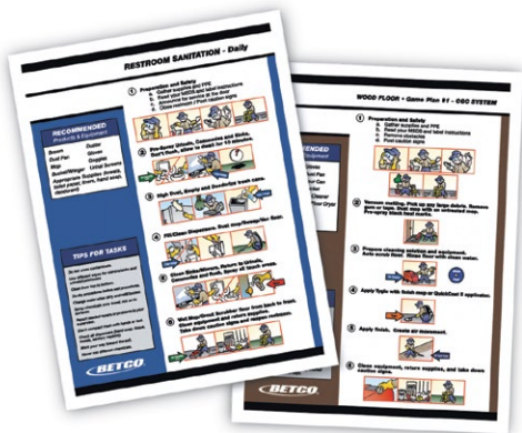
TASK CARD PROGRAM Customizable Task Card Creator