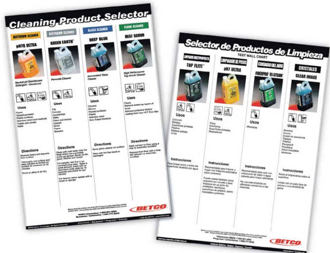
FASTDRAW® WALL CHART PROGRAM Customizable Wall Chart Creator