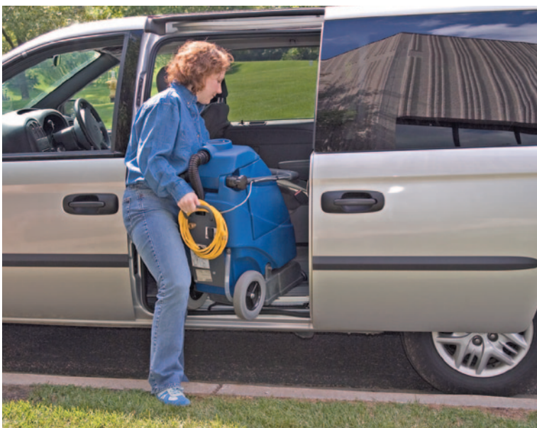
Hand grips and compact folding simplify easy lifting and transport.