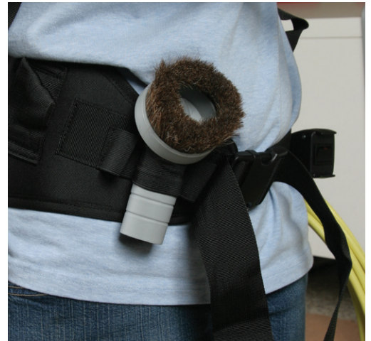
The belt has convenient tool storage.