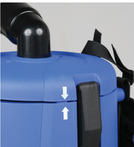
Arrows assist operator with securing canister lid and latches in the correct position. Easy to snap latches allow access to the canister and paper bag.

Onboard tool storage for quick and easy tool change. The complete tool kit is ideal for carpet and hard floors, overhead, and detail cleaning operations.