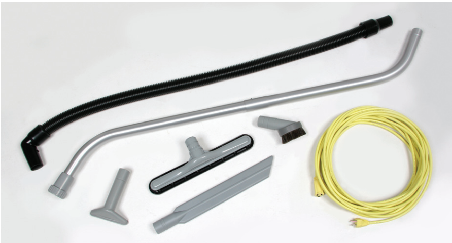
The standard tool kit fits all your cleaning needs. Ideal for carpet and hard floor areas.