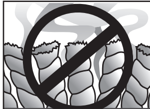
WORKS IMMEDIATELY TO ERASE ODORS