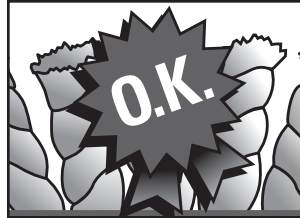
SAFE FOR PERSONNEL AND ON SURFACES